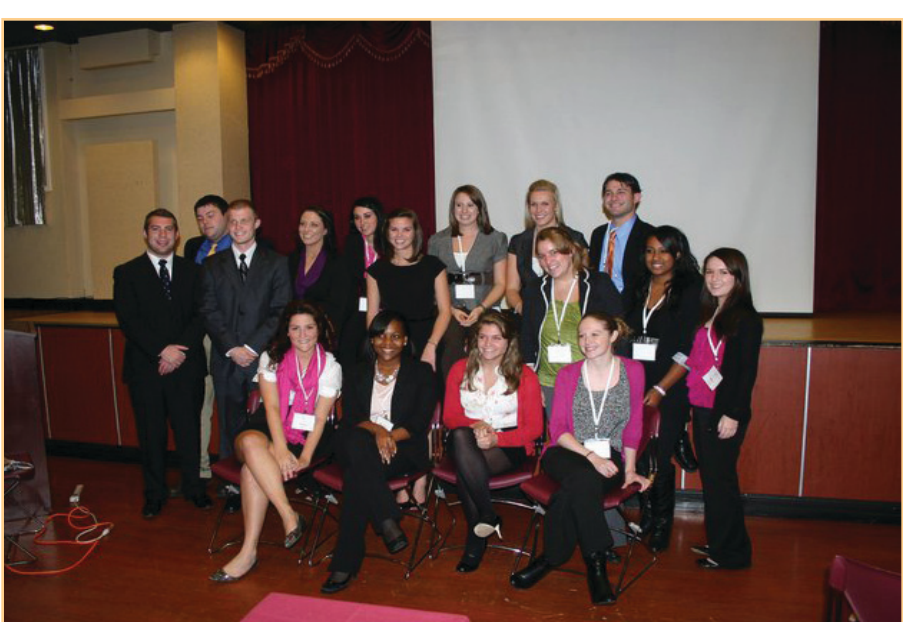
Students in attendance at last year's conference

The 69th Annual NYSCA Conference, Communication Connections: Contributions and Collaboration Between Distanced Groups, promises to be equally exciting, thought-provoking and engaging. NYSCA prides itself on its long history and commitment to bringing students, scholars, administrators and industry